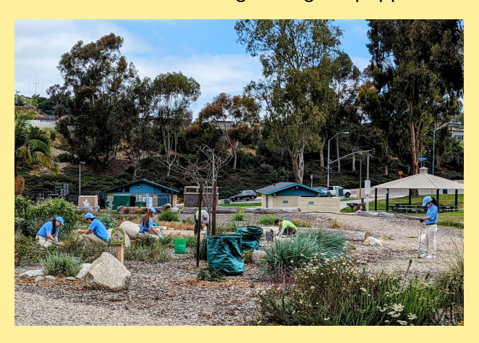
Honda Helpers weeding in the gardens in June.