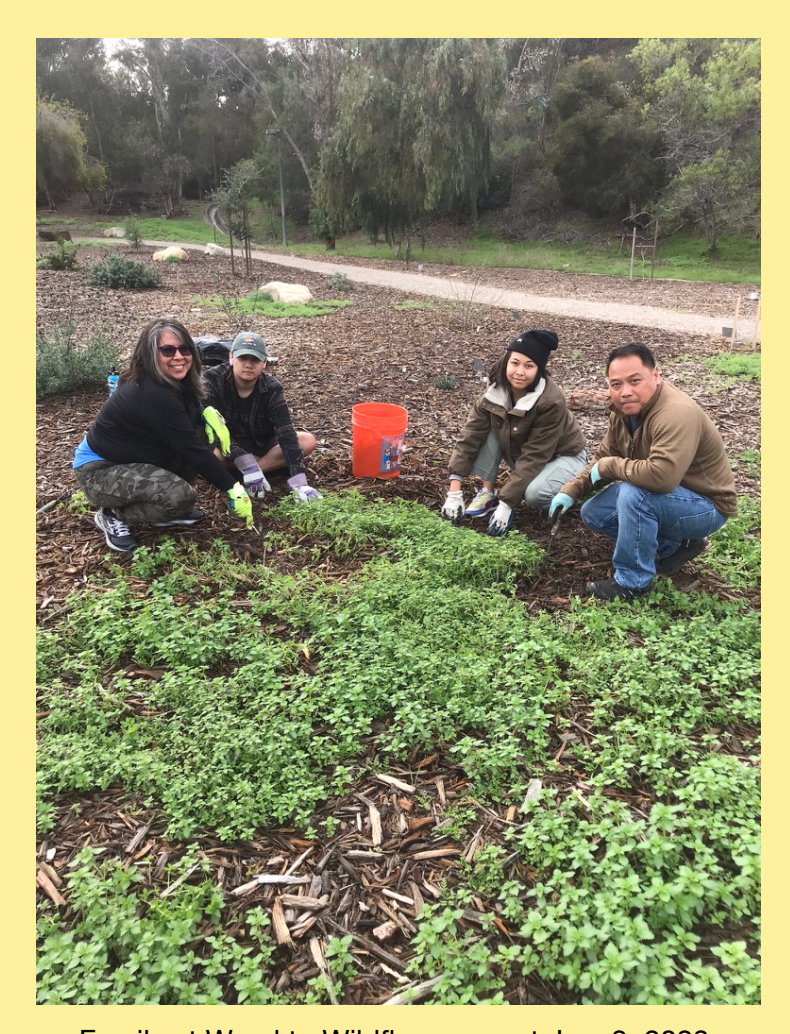
Family at Weed to Wildflower event Jan. 3, 2023.

During the past year, in addition to our core group of Paradise Gardener talented volunteers we have had volunteers join our work days from our community, our Councilmember's office, other garden clubs, local high schools, Honda Helpers, Master Gardeners and others.