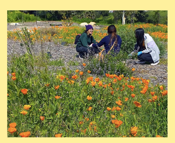
San Diego School of Creative and Performing Arts students weeding among the poppies.

First they cleared an area of stinging nettle and then broadcast wildflower seed donated by Pollinator Partnership.